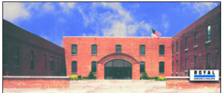
Home of Royal Adhesives & Sealants

For over fifty years, Royal Adhesives & Sealants has been a leader in adhesive technology, providing superior quality and performance for the most difficult bonding applications. Our fully staffed state-of-the-art laboratory can develop custom formulations to meet any need. Testing services are also provided based upon individual requirements.