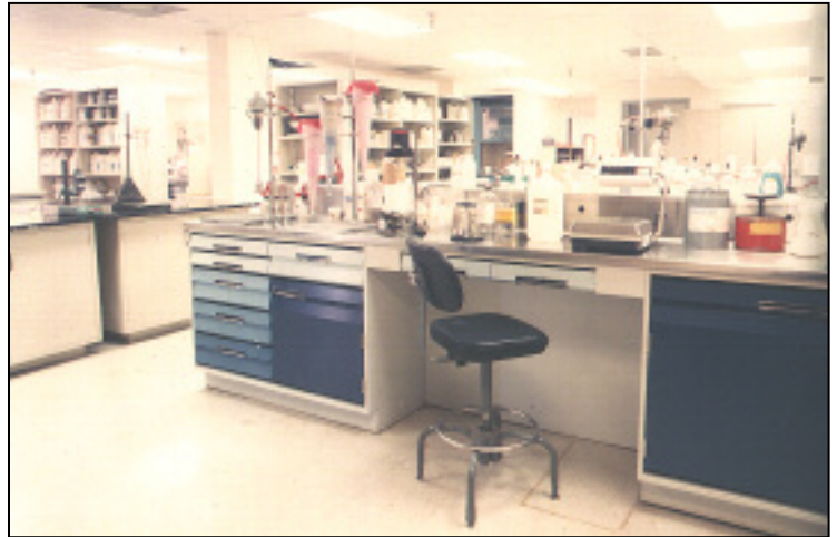
Research and Development Labs

Contact Adhesives are available in both solvent and water-based formulations. Silaprene solvent based contact adhesives provide strong tack and quick strength buildup with flexible bonds that resist heat, cold and water. They can be used to bond rubber and vinyl flooring as well as general purpose applications. Our Hydra FAST-EN brand water based sprayable contact adhesives are designed to bond a wide variety of porous and nonporous surfaces where using solvent based systems may be a health or environmental concern. They can be used to adhere headliners or carpeting, and for HPL laminating for cabinet work.